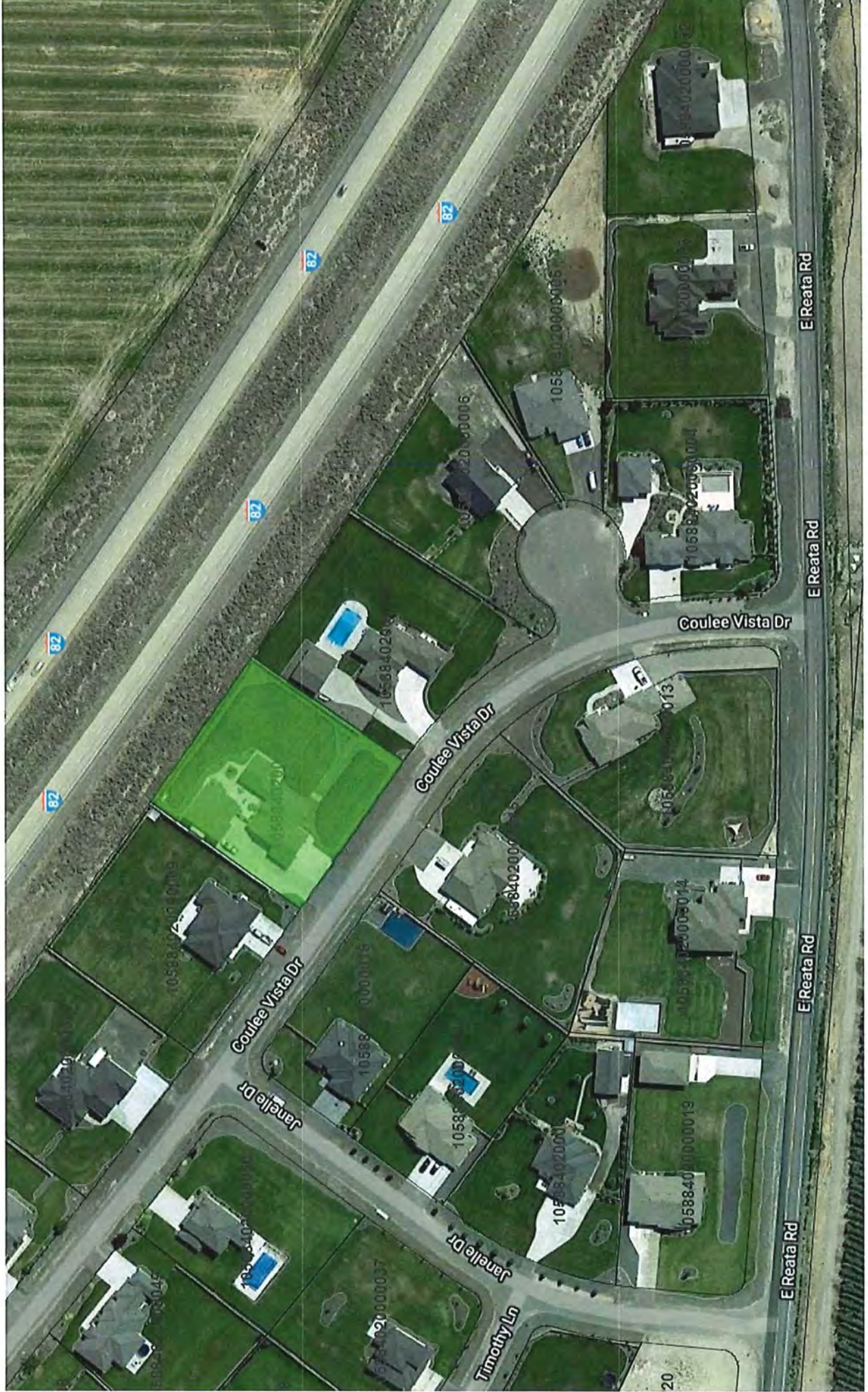
CUP 2020-014 Vicinity Map (Recker) created by Benton County Planning Dept.